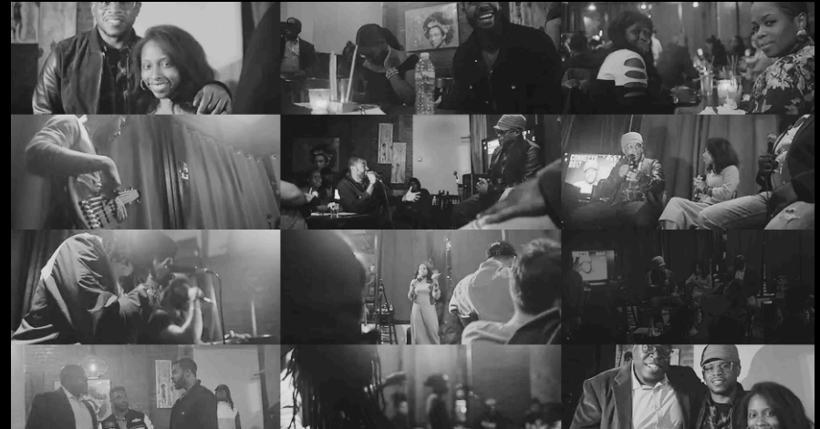
Keynote Conversation with Sway Calloway & Music Showcase.