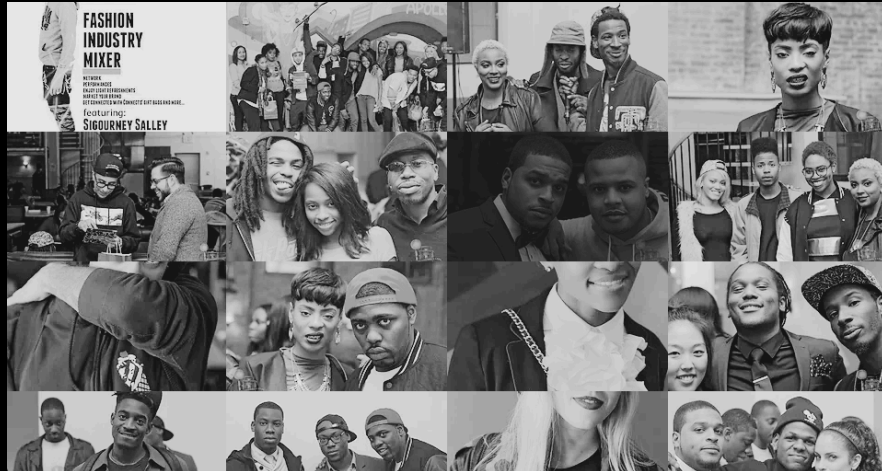
Fresh Like Us Fashion Networking w/ Sigourney Salley & cast of VH1's Black Ink Crew.

archives . photos & videos available on site.